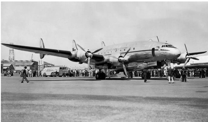
(Qantas Heritage Collection 1802-107)

http://www.aussieairliners.org/l-1049/vh-eaa/vheaa.html